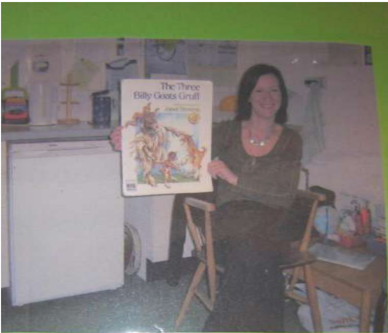
We chose The Three Billy Goats Gruff.