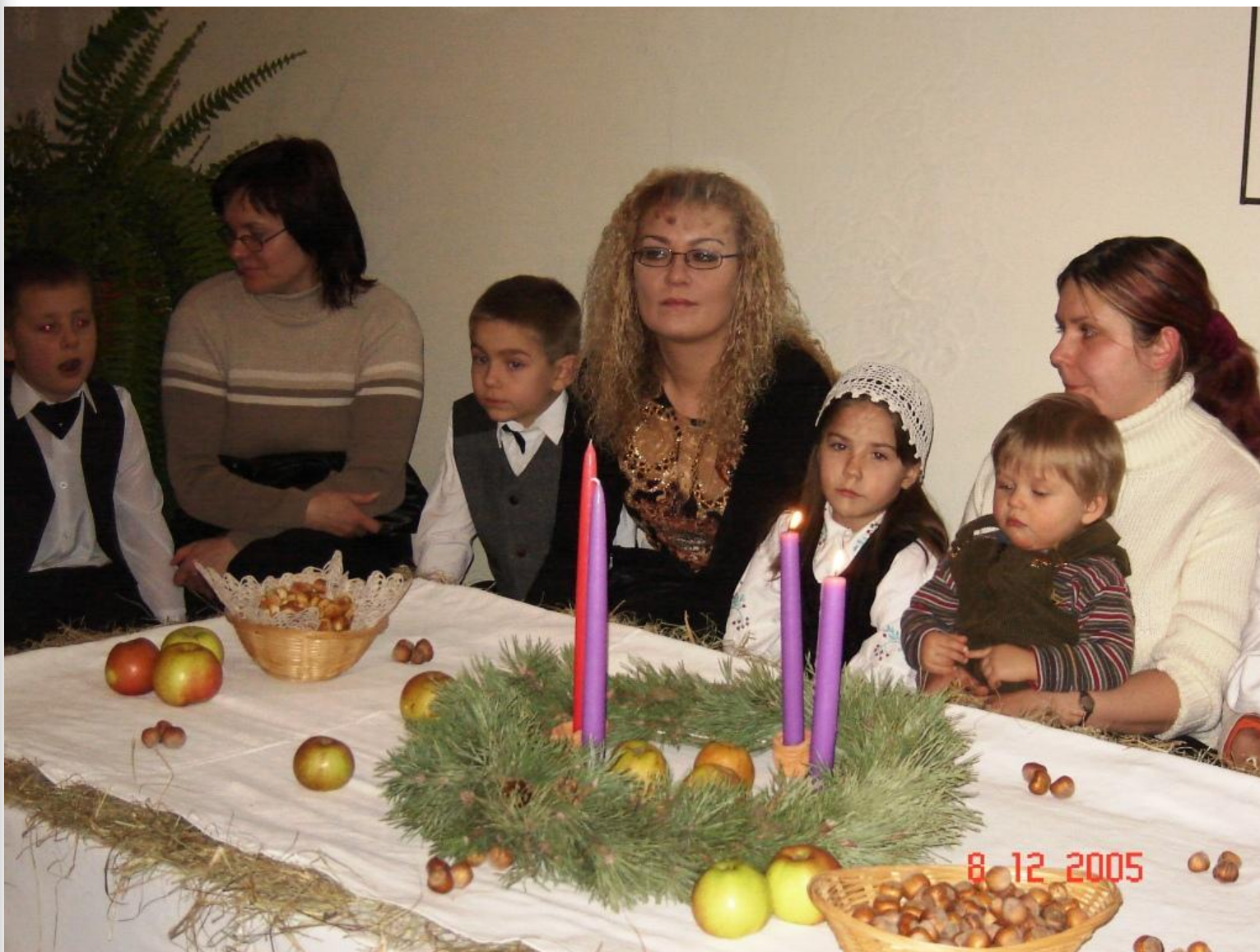
Klaipėdos lopšelis-darželis "Volungele", Lithuania