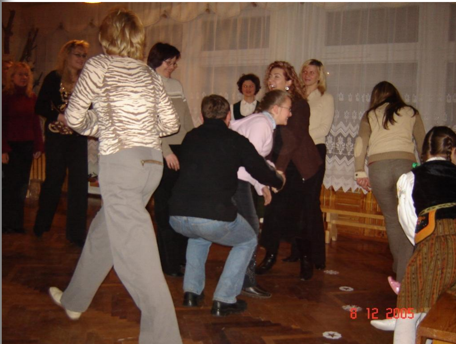
Klaipėdos lopšelis-darželis "Volungele", Lithuania