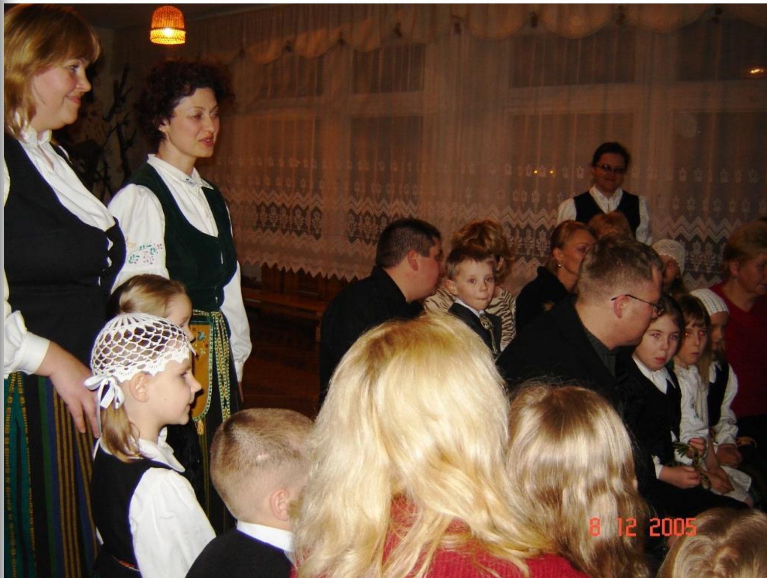
Klaipėdos lopšelis-darželis "Volungele", Lithuania