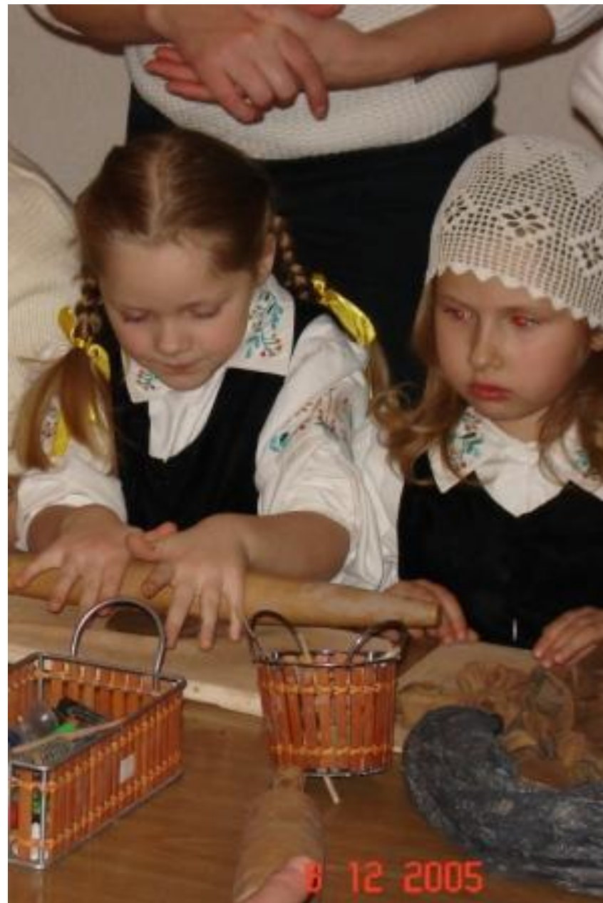
Klaipėdos lopšelis-darželis "Volungele", Lithuania