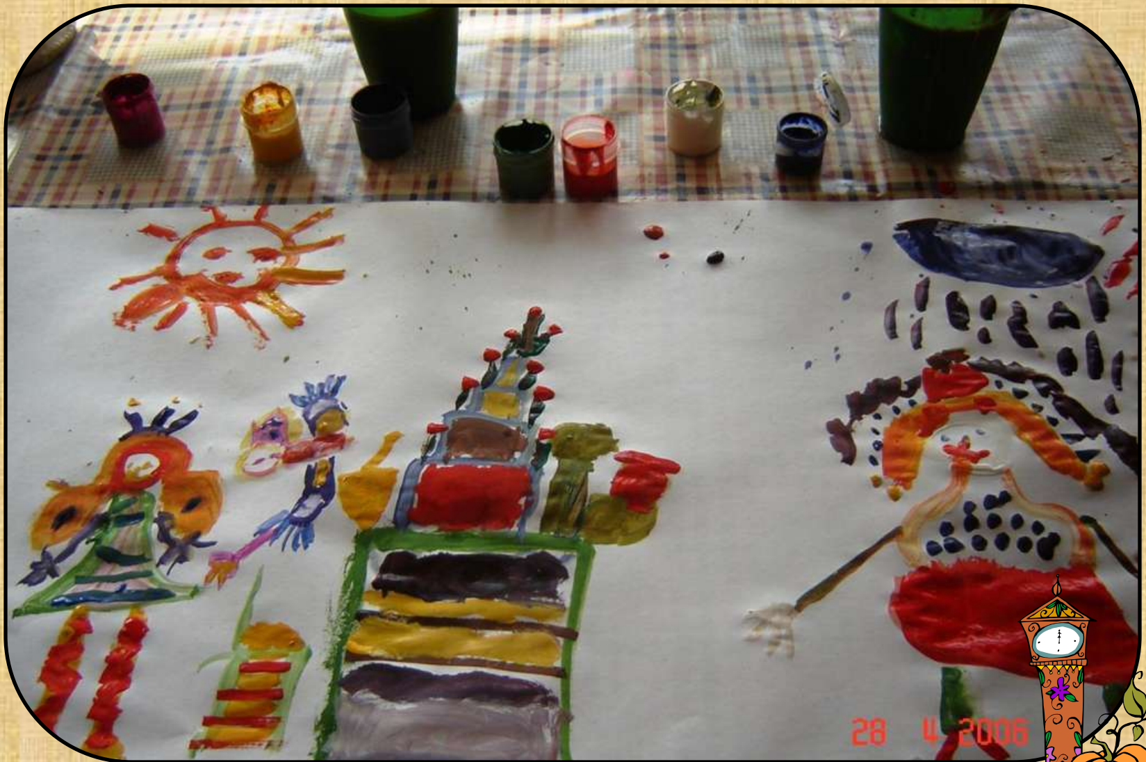
2006 Lithuania, Cinderella