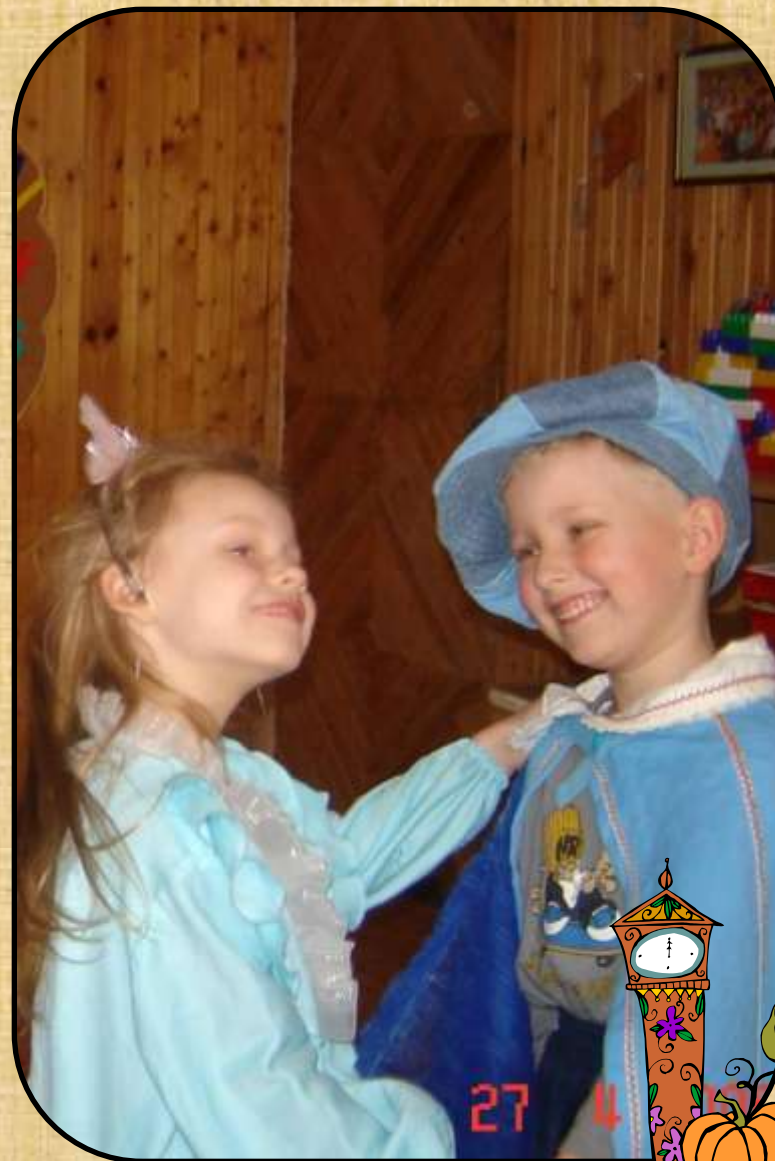
2006 Lithuania, Cinderella