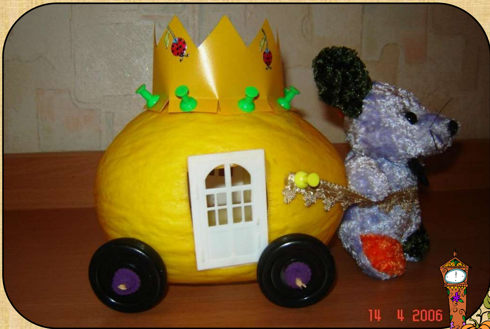
2006 Lithuania, Cinderella