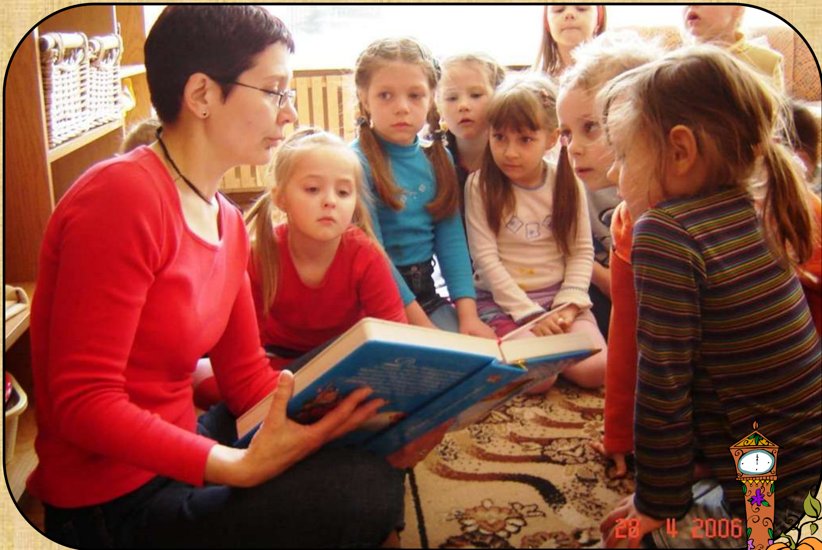
2006 Lithuania, Cinderella