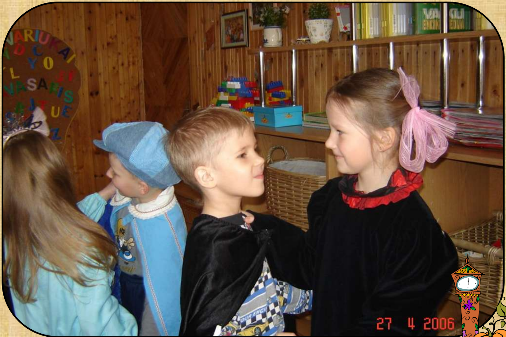
2006 Lithuania, Cinderella