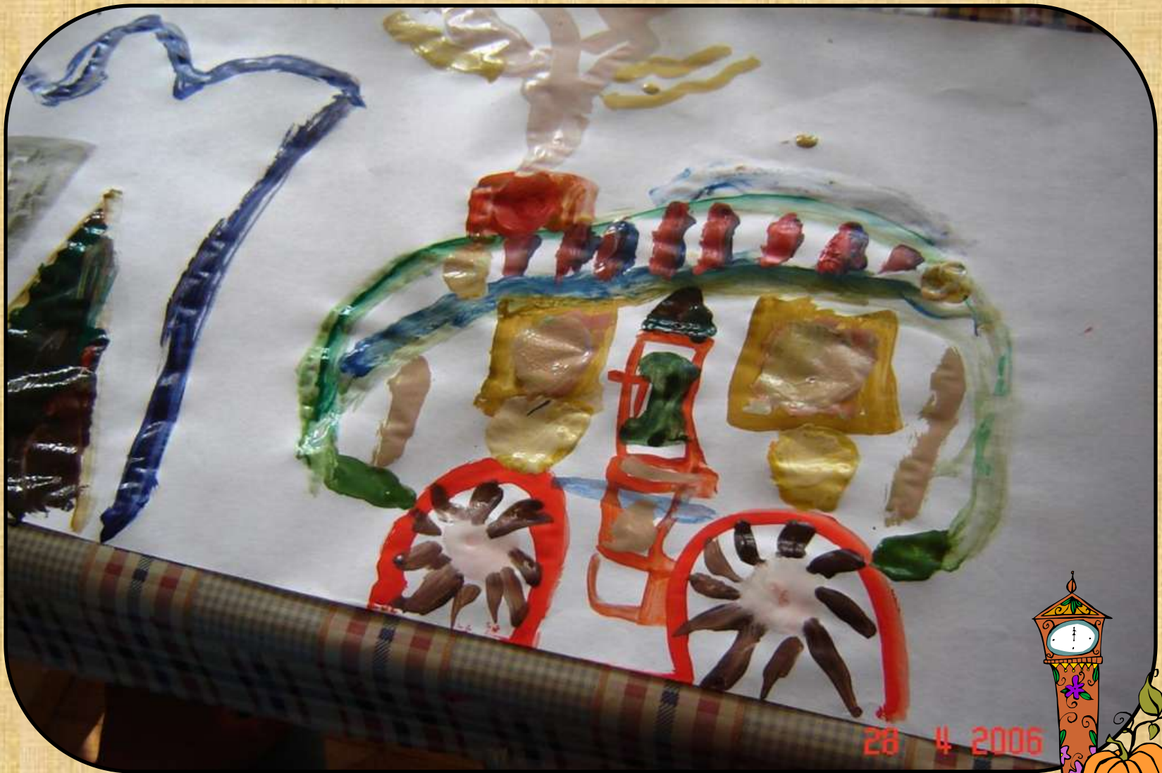
2006 Lithuania, Cinderella