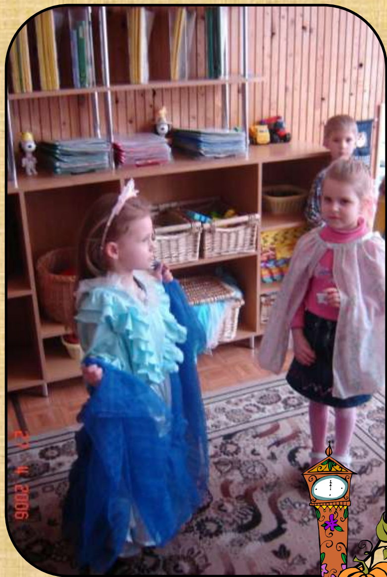
2006 Lithuania, Cinderella