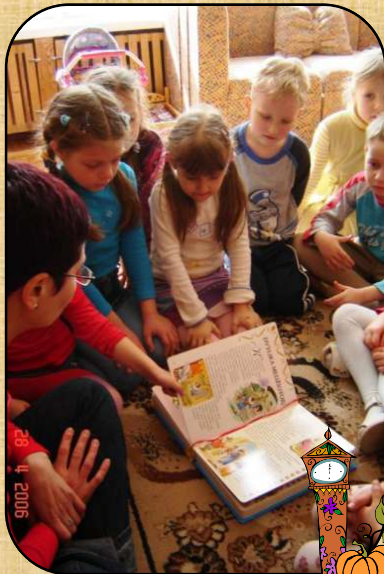
2006 Lithuania, Cinderella