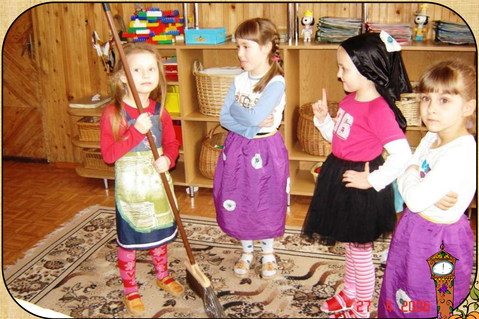
2006 Lithuania, Cinderella