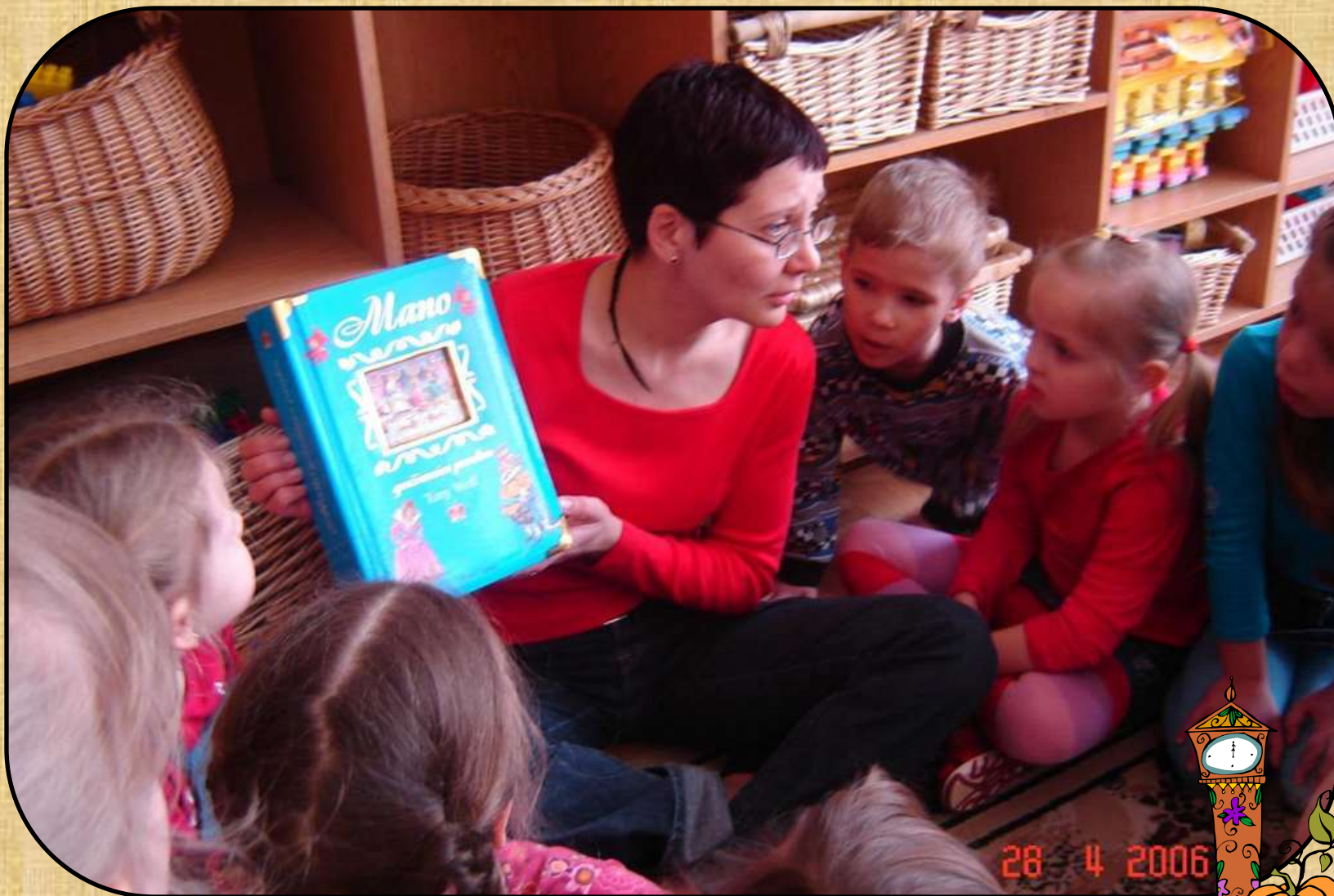
2006 Lithuania, Cinderella