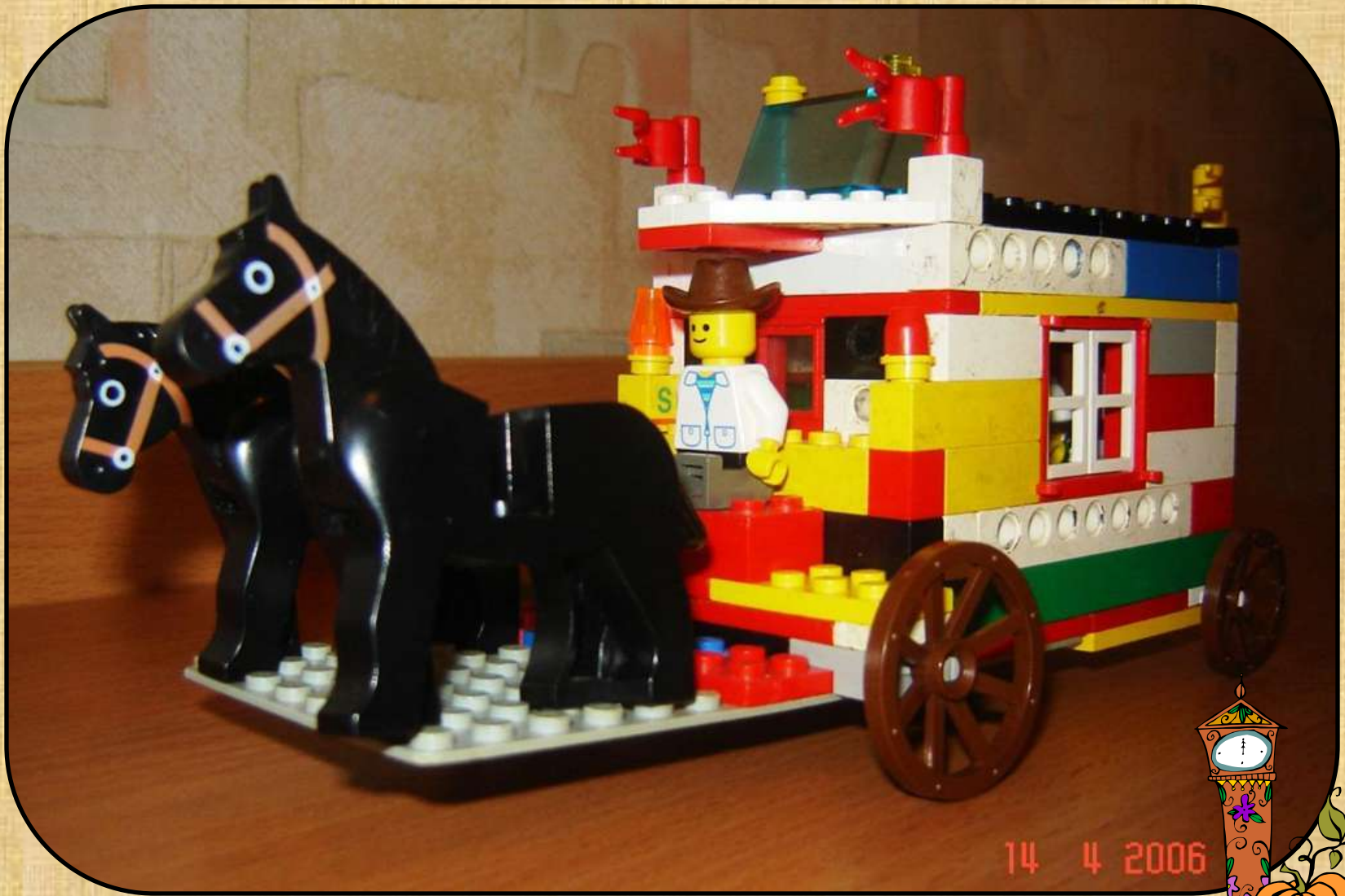
2006 Lithuania, Cinderella