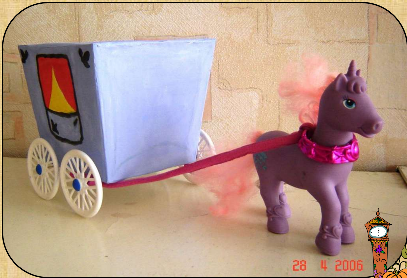
2006 Lithuania, Cinderella