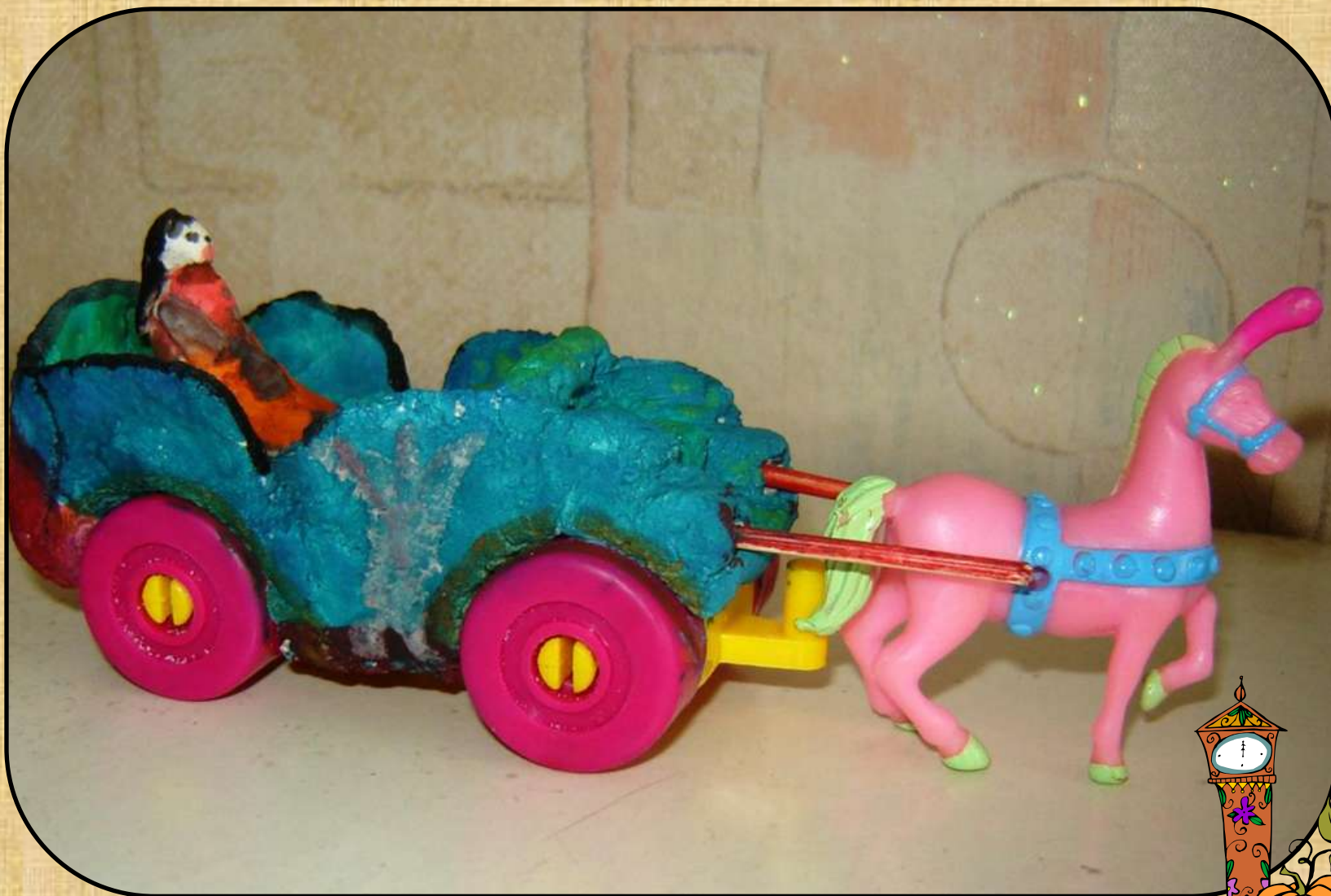
2006 Lithuania, Cinderella